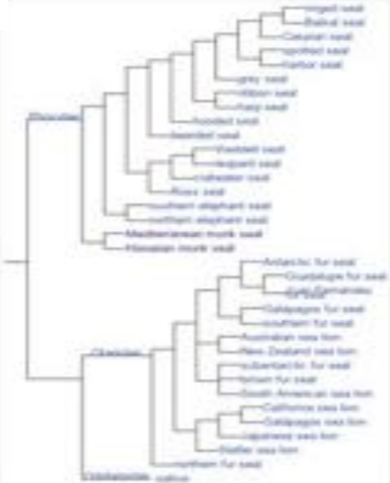
Cladogram showing relationships among the pinnipeds, combining several phylogenetic analyses [1]